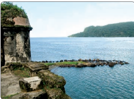
Historic Fort, Panama