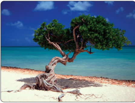
Divi Divi tree, Aruba

205 Donerail Court Havre de Grace, MD 21078