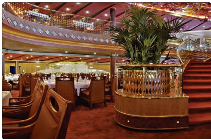
Vista Dining Room

The Panama Canal stretches from the Caribbean Sea in the north to the Pacific Ocean in the south. The key to operating the locks system in the canal is Gatun Lake, formed by an earthen dam 85 feet above sea level. The water from the lake runs downhill to fill the locks with no pumps or power other than the force of gravity.